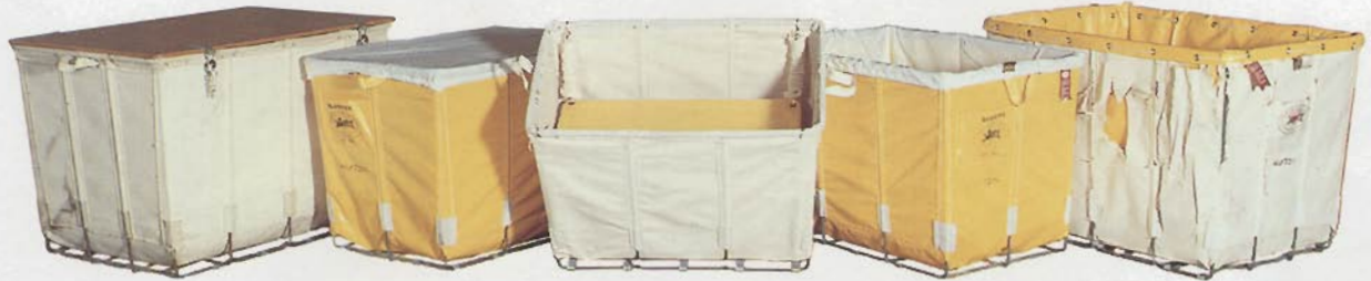
40-200 SHIPPING HAMPER

Make DANDUX products work for you with our optional accessories: